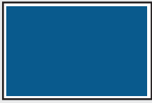
Spread 14 3 / 4 " x 10" non-bleed 15 3 / 4 " x 11" bleed